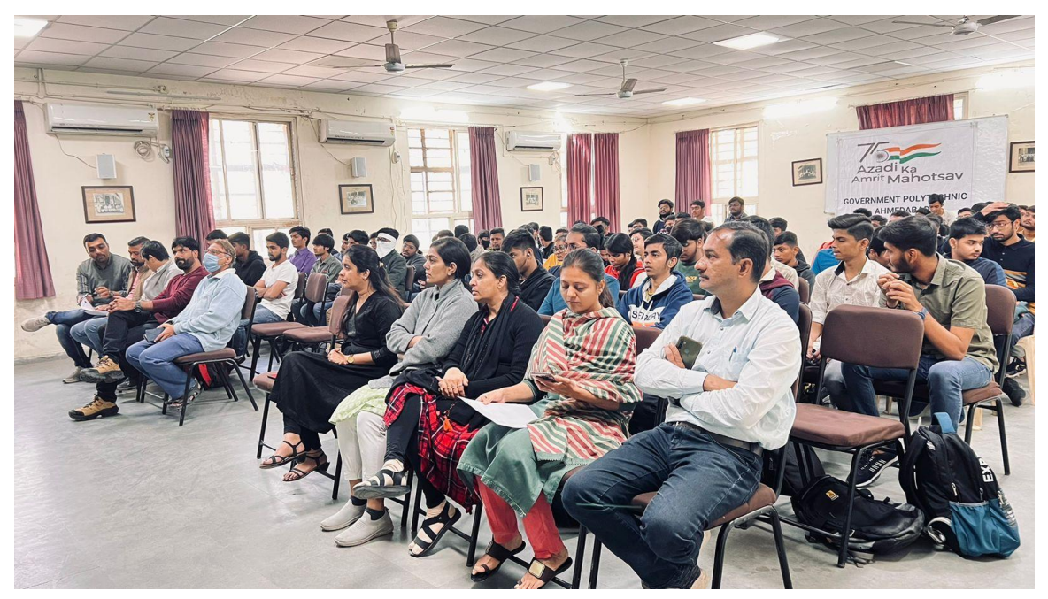
STUDENTS BRAIN-STORMING AND IDEA-GENERATION ACTIVITY