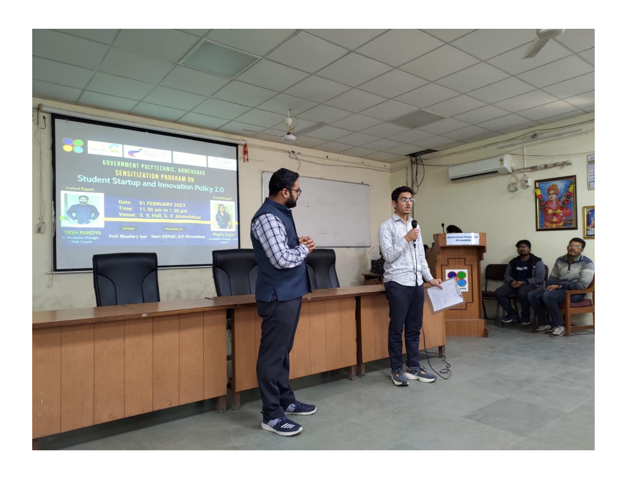
FELICITATION OF INVITED GUEST EXPERT SPEAKERS BY RESPECTED PRINCIPAL SIR.